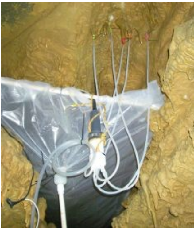
The “Stalactite Milking Machine”