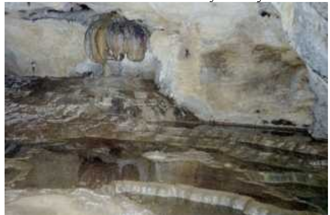
Chandelier and rimstone pools in Buchanan Saltpeter Cave.